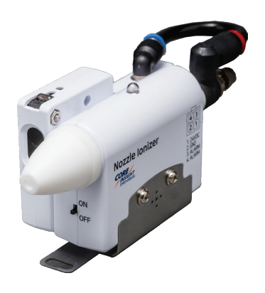
Model 4120 Nozzle Ionizer